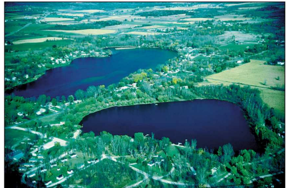
Figure 9: Two lakes in upper Midwest.