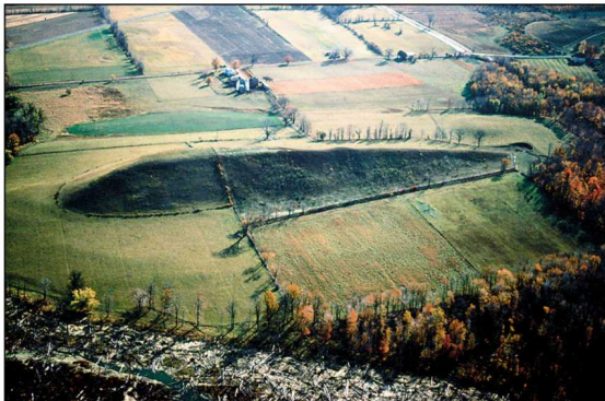
Figure 8: Hill in upstate New York.