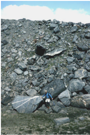
Figure 10: Glacial deposit. Note person for scale.