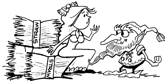
Illustration ©Michael Donahue 1996

“I had met Rumpelstilzkin two days earlier at the Governor’s mountain cabin. I was locked inside a small room filled with straw. Except for the straw, the only items in the room were a small bed and a spinning wheel. I was in tears for I was unable to spin the straw into gold, and I was very frightened. All of a sud-