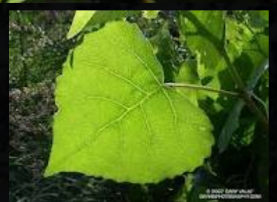
Specimen B Specimen C